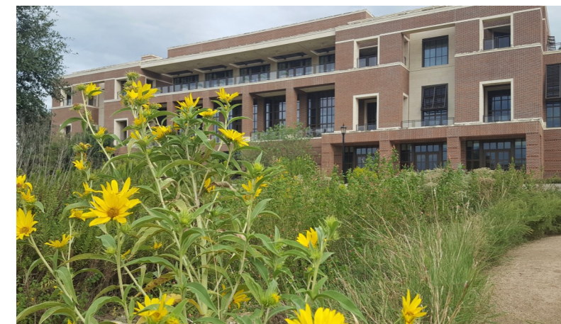
The Bush Center in background, Maximilian Sunflowers on pathway

A one mile network of paths will take you through native Texas environments such as Blackland Prairie, Post Oak Savannah and Cross Timbers Forest.