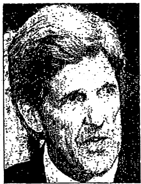
Sen. John Kerry

In California, meanwhile, Gov. Gray Davis is seeking to review 36 undeveloped leases to study potential environmental impacts before they are reissued by the federal government. The Bush administration has tried to proceed without the review - but has lost two legal rounds and is now considering taking the