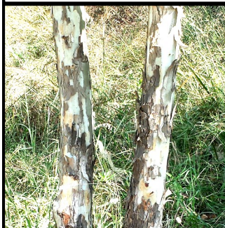
Stop #4: This tree has very noticeable peeling bark, another is located further down the path. (Continue around on the grassy path and stop on the bridge.)

Guidance: Only certain joints in the seep are open. You may see water dripping from them. Try to point some out.