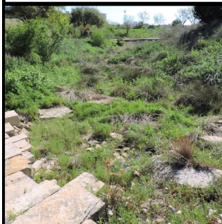
Stop #5: Look below on both sides of the bridge to study the bioswale. The one from the seep runs under this bridge to the wet prairie. (Stay on the bridge—it’s Stop #6)

Guidance: Since sycamores are fast growing trees, their bark can’t expand as quickly as needed and it breaks and peels off. Similar to how a snake sheds it’s skin.