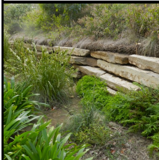
Stop #3: Shortly into the grassy path, you’ll find the “seep” on the right—it looks like a stone wall. (Turn around and you’ll see Stop #4.)

Guidance: It’s not super green, it may be rougher, it has an uneven surface, etc.