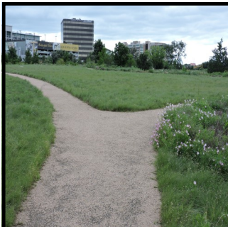
Stop #2: The Great Lawn is all “Habiturf”. Take time to study the turf here. (Next, head West and take the grass path — on the right — into the woods.)

2. Habiturf —This mix of native grasses, used throughout the grounds and Great Lawn, was developed by Texas researchers in order to conserve the natural resource of water. It is drought-resistant, needs little fertilizer, and needs mowing only 3-4 times a year!