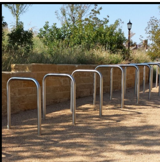
Stop #1 —the bike racks are near the entrance to the park. (Then head down the gravel path to the left—toward the Great Lawn—to Stop #2.)

NOTE: The park is a dynamic environment. Everything on the scavenger hunt list may not be found in one visit. Encourage the students to revisit the park with their parents to show what they've learned and maybe check off a few more items. We're open year-round from sunrise to sunset and admission is always free! We offer both Spring and Fall versions of the scavenger hunt.