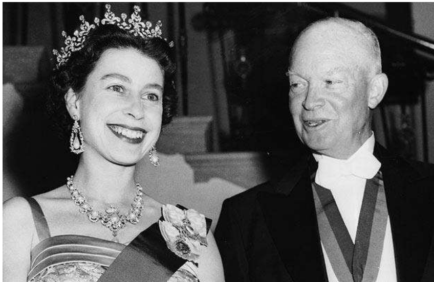
President John F. Kennedy and First Lady Jacqueline Kennedy dine at Buckingham Palace with Queen Elizabeth and Prince Phillip, June 1961.