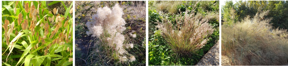
Inland Sea Oats Chasmanthium latifolium Bushy Bluestem Andropogon glomeratus Little Bluestem Schizachrium scoparium Switchgrass Panicum virgatum

6. Rose Garden - entrance from the Oval Office provides a quiet stroll among Southern Magnolias, Natchez Crape Myrtle, Chaste Trees, Texas Mountain Laurel, and a variety of seasonal native annuals and perennials, along with an aquatic garden. Highlights are heat-tolerant Perle d'Or Roses and Brazilian Rock Rose bushes.