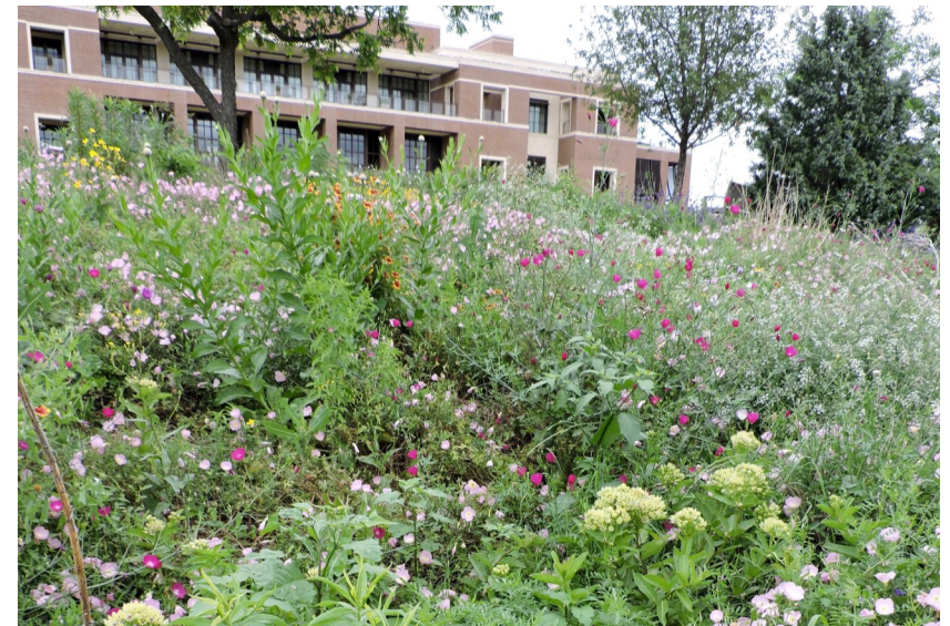
The Bush Center from the south, overlooking the Native Texas Park.

A one mile network of paths will take you through examples of 3 native Texas ecoregions: Blackland Prairie, Post Oak Savannah and Cross Timbers Forest.