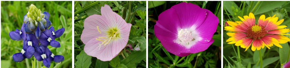
Texas Bluebonnet Lupinus texensis Pink Evening Primrose Oenothera speciosa Winecup Callirhoe involucrata Indian Blanket Gaillardia pulchella