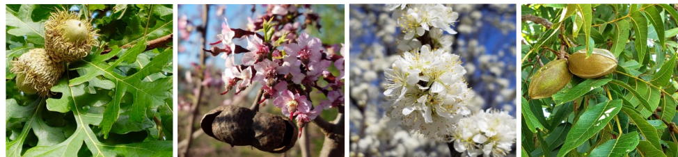
Bur Oak — Fall Quercus macrocarpa Mexican Buckeye—Spring Ungmadia speciosa Mexican Plum—Spring Prunus mexicana Pecan—Fall Carya illinoensis

Resource Links: Instagram: Mockingbirdsandbluebonnets Lady Bird Johnson Wildflower Center: wildflowercenter.org Native Plant Society of Texas - NPSOT.org: specific Texas plant search