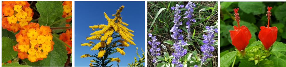
Texas Lantana Lantana urticoides Tall Goldenrod Solidago altissima Mealy Blue Sage Salvia farinacea Drummond's Turk's Cap Malvaviscus arborea