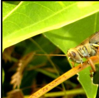
Stop #4: As you're heading toward the bridge you may see some grasshoppers in the plants on the hill. (Cross the bridge and follow the grassy path to the top of the ridge.)

Guidance: This is a Northern Mockingbird nest. They may get water from the bioswales, forebay, or wet prairie. They eat insects in the summer and fruit in fall and winter.