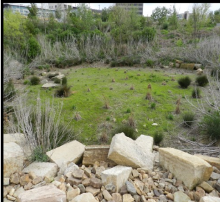
Stop #7: Stop in the center of the wood bridge and notice the wet prairie with the cistern beneath. (Turn around and look on the other side of the bridge...)

Guidance: Hummingbirds are attracted to the color red.