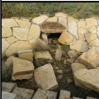
Stop #9: Pause here and discuss the purpose of the Forebay in the hydrology system at the park. (Continue on the path to the amphitheater area...)

Guidance: Mainly birds, but mice and other rodents will also eat the sunflower seeds.