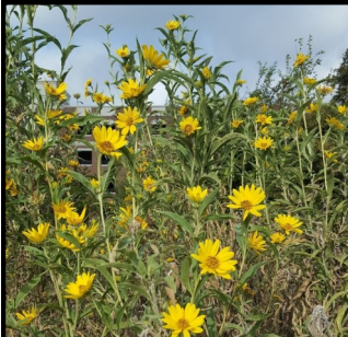
Stop #8: You'll see several tall Maximilian Sunflower plants. They may be dried or flowering. (Turn around and walk down the stone path toward the building...)

Guidance: The water would run through the city storm-water drains and away to other parts of the city where it may cause erosion and flooding.