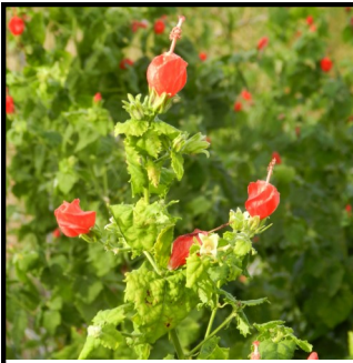
Stop #6: Right before the grassy path meets the stone path is a big Turk's Cap plant - on the left. (After viewing it, turn left on the stone path toward the bridge...)

6. Turkscap —These flowers have adapted to attract pollinators. When a hummingbird sips nectar from inside the flower, its head picks up pollen, too. Then, as the bird moves from flower to flower tasting more nectar, the pollen rubs off on the pistil of a new plant, thus fertilizing it, resulting in the production of the fruit. In Fall, you may spot a hummer!