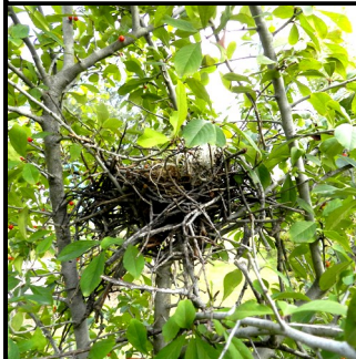
Stop #3: This nest is in a tree between the SEEP and the path—about eye-level. (Continue down the path, toward the wooden bridge.)

Guidance: Rainwater will soak into the ground rather than become run-off on a concrete path.