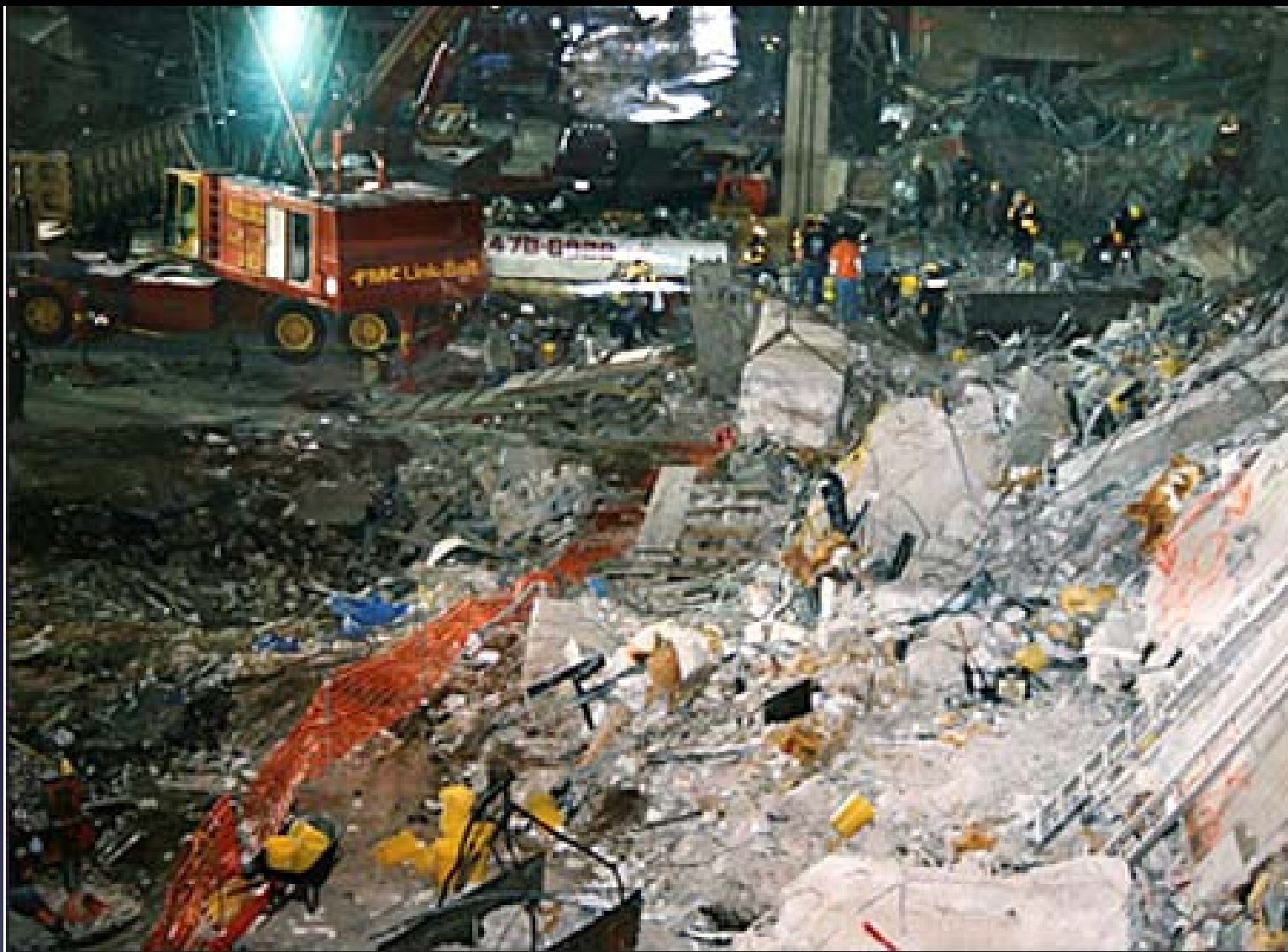
Investigators going through the rubble following the bombing of the World Trade Center.