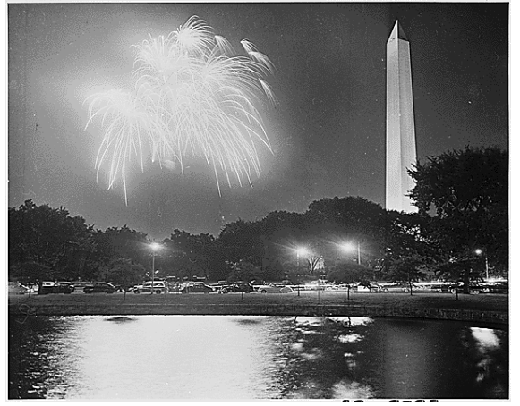
Photograph of fireworks going off in the night sky by the Washington Monument, during ceremonies celebrating the 175th anniversary of the Declaration of Independence., 07/04/1951, ARC Identifier: 200339

Historians use primary sources to learn about history. The pictures below were taken on Independence Day. Use the pictures and what you know about the Fourth of July to describe why the holiday is important to Americans and how we celebrate it.